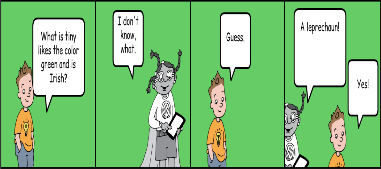
This comic strip was created at MakeBeliefsComix.com . Go there to make one yourself!